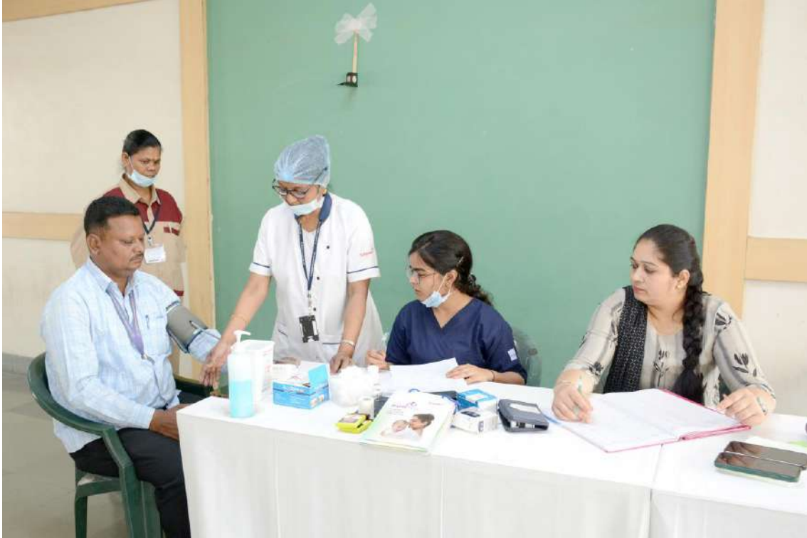
Figure: Health check-up