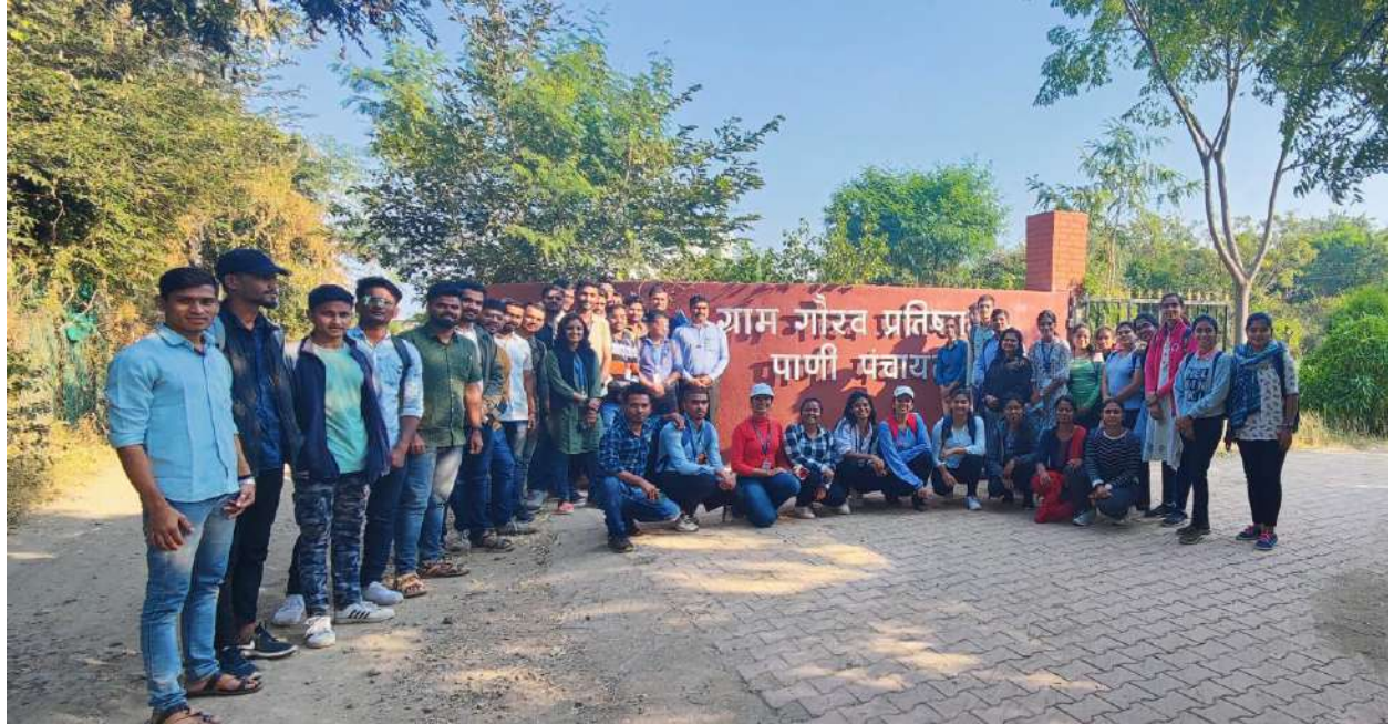
Figure: Academic visit and study tours