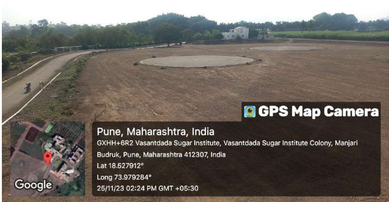
Figure: Playground for sport activities