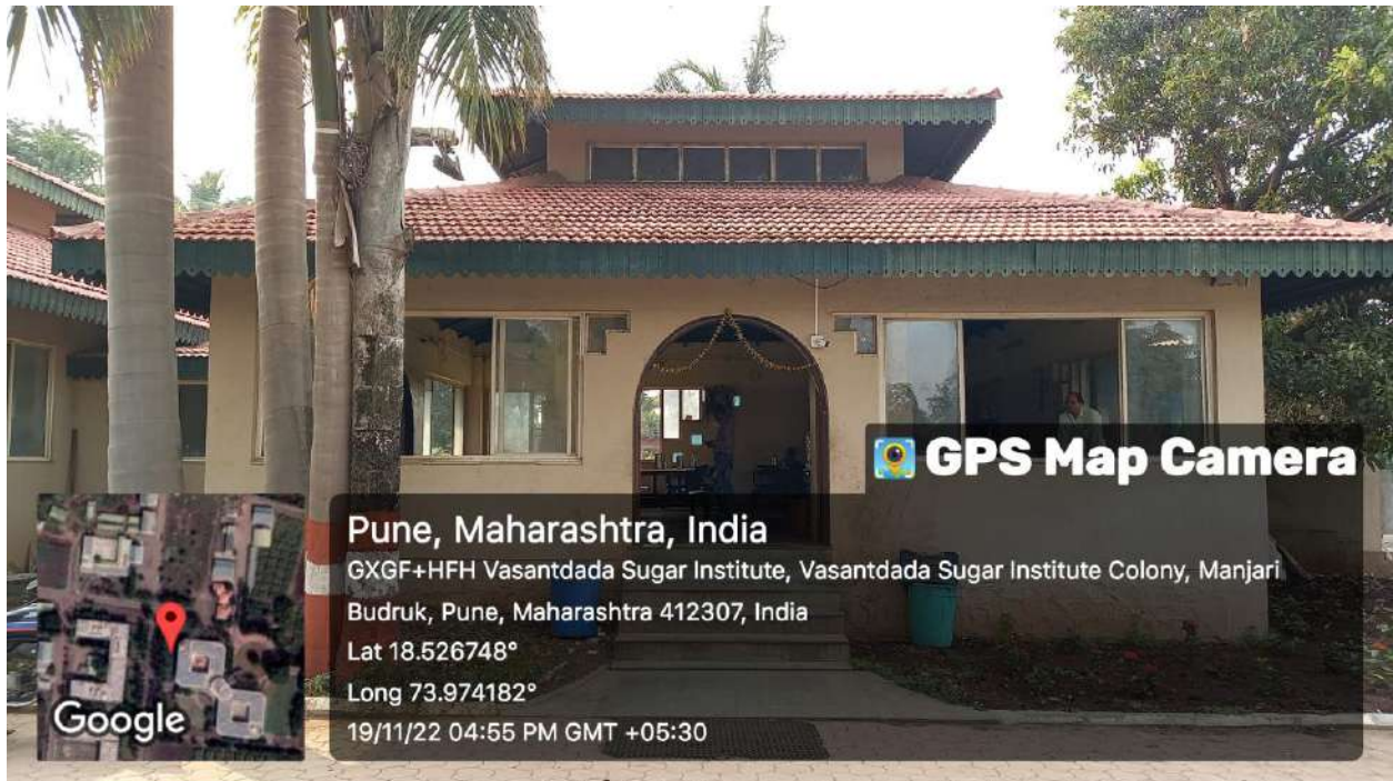
Figure: VSI Canteen