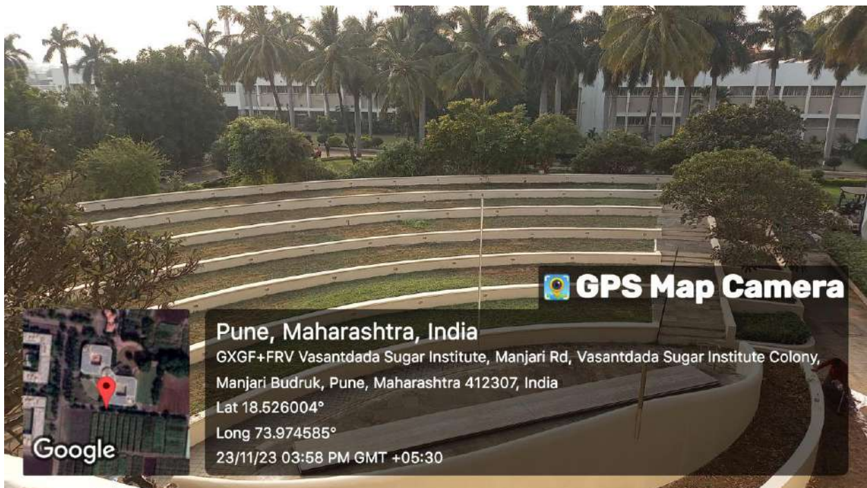
Figure: Open Amphitheatre for programs