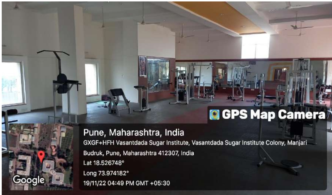
Figure: Gymnasium facilities