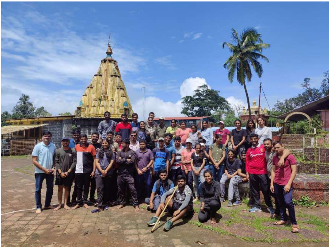
Figure: Academic visit and study tours