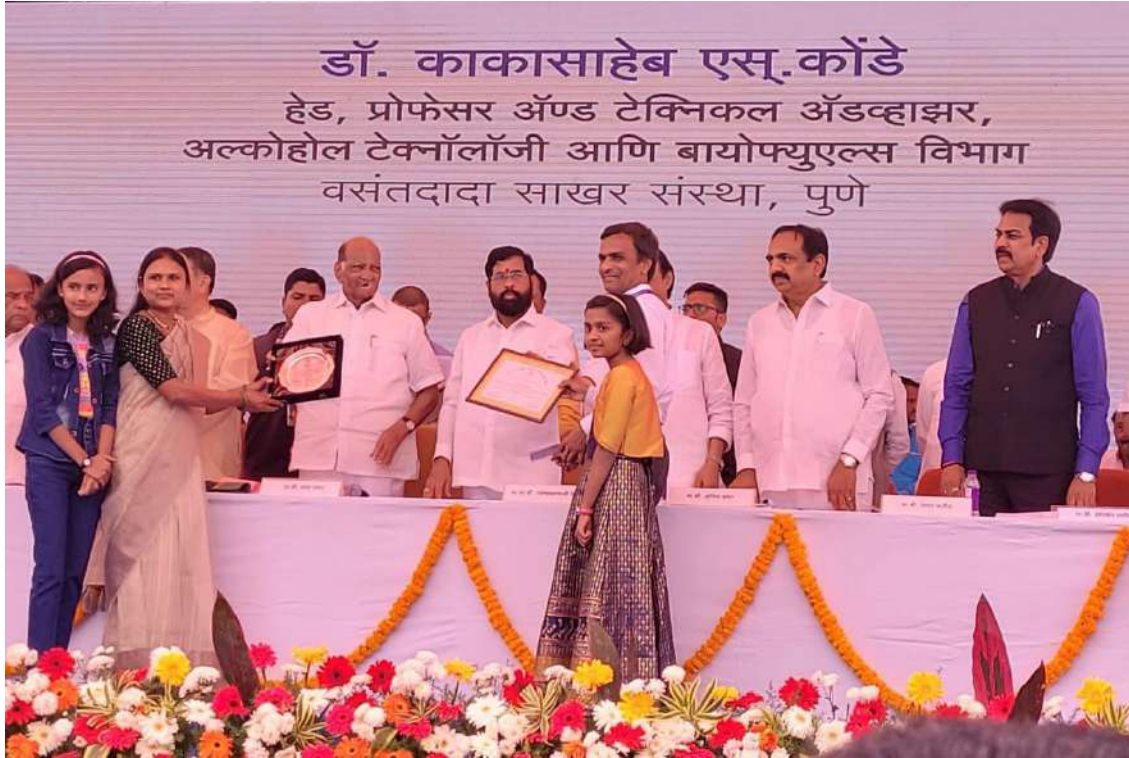
Figure: Felicitation of staff members on their achievements