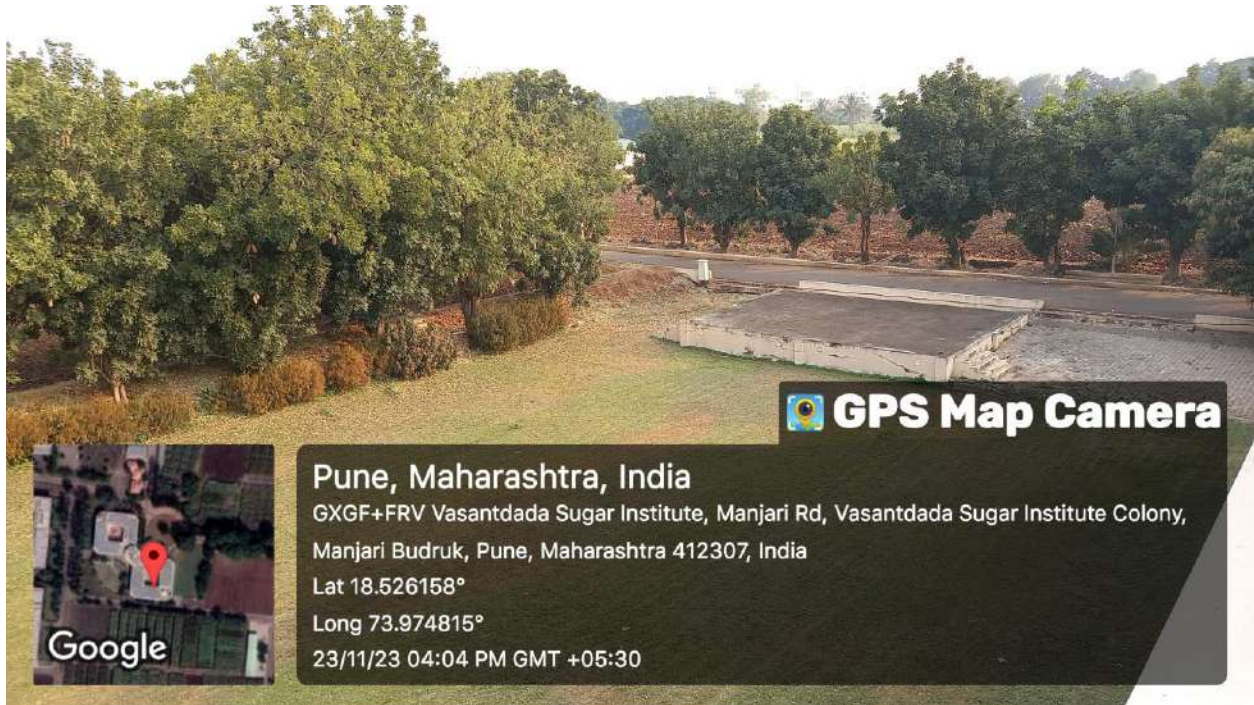
Figure: Space for cultural activities