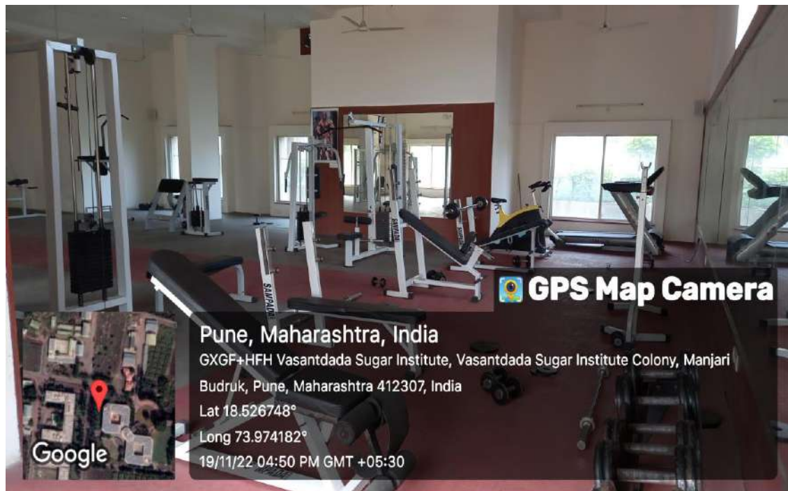
Figure: Gymnasium facilities